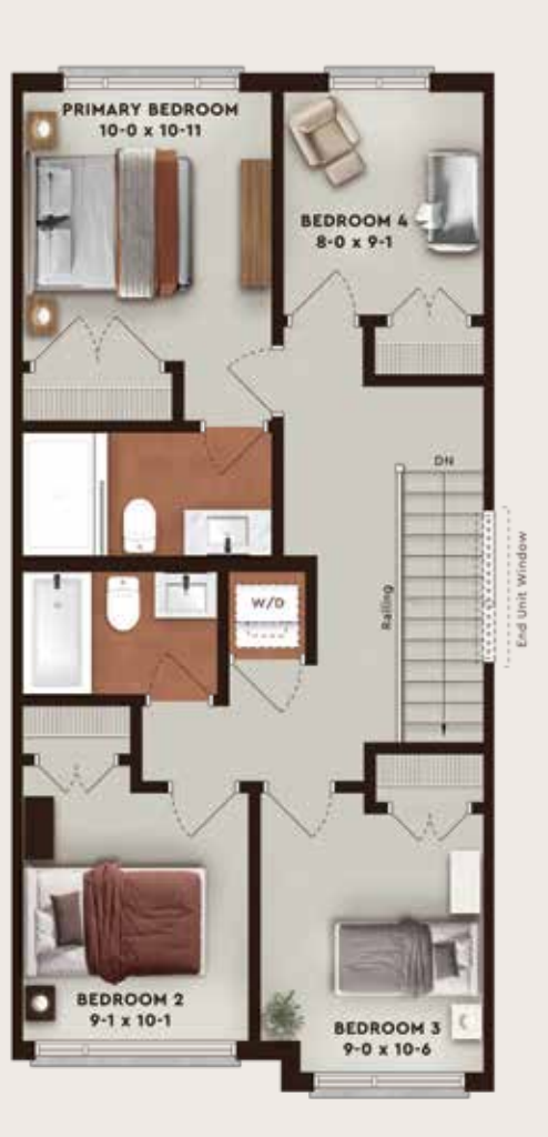
Third Level – Optional 4 BEDROOMS