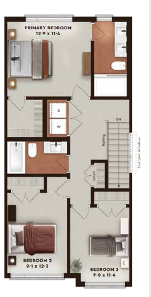
Third Level 3 BEDROOMS