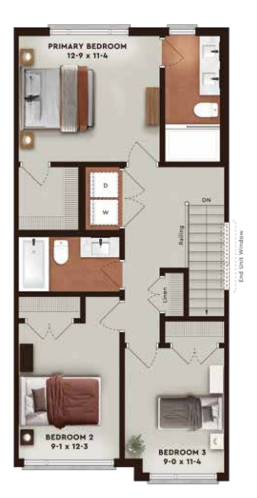
Third Level 3 BEDROOMS