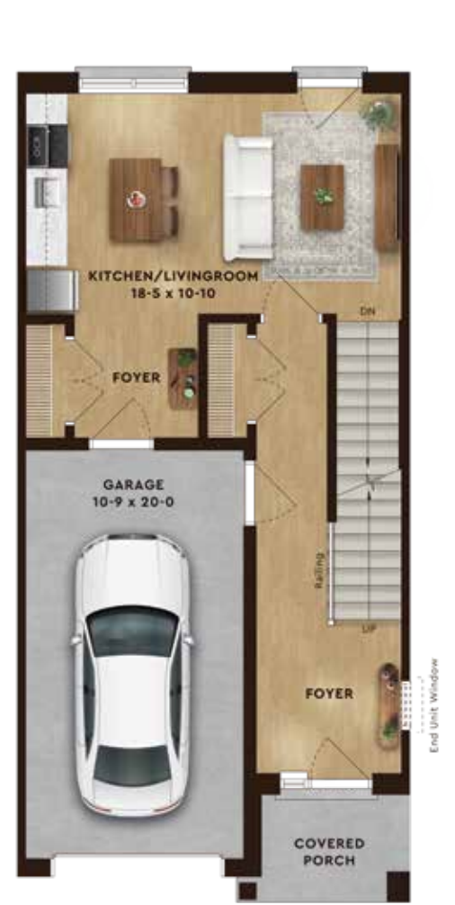
Entry Level KITCHEN & LIVING