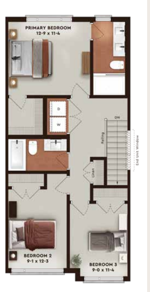
Third Level 3 BEDROOMS