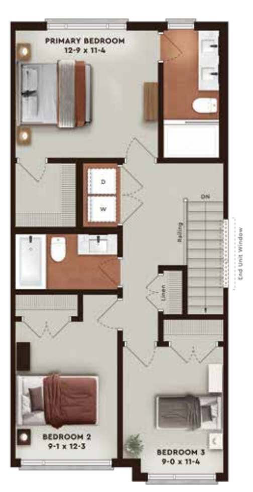
Third Level 3 BEDROOMS