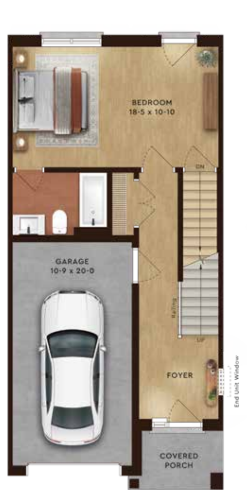
Entry Level BEDROOM