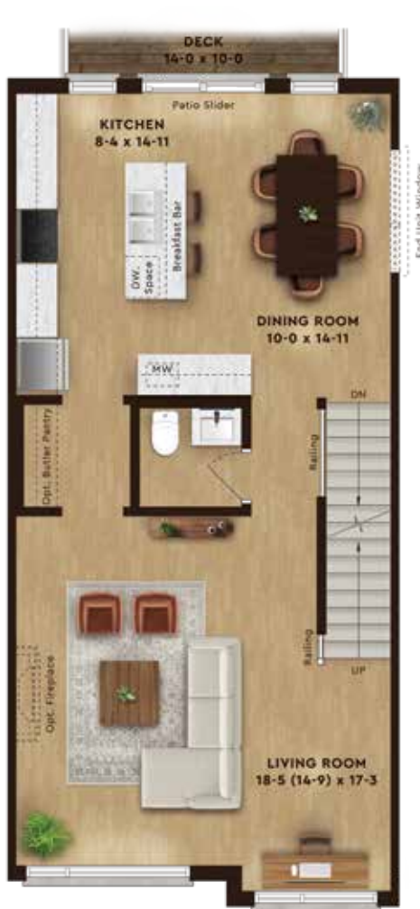
Second Level LIVING & DINING