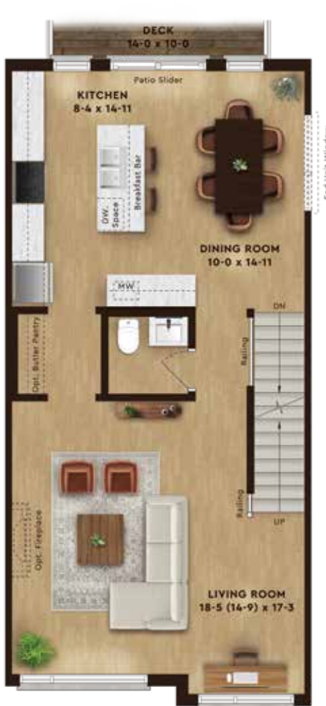
Second Level LIVING & DINING