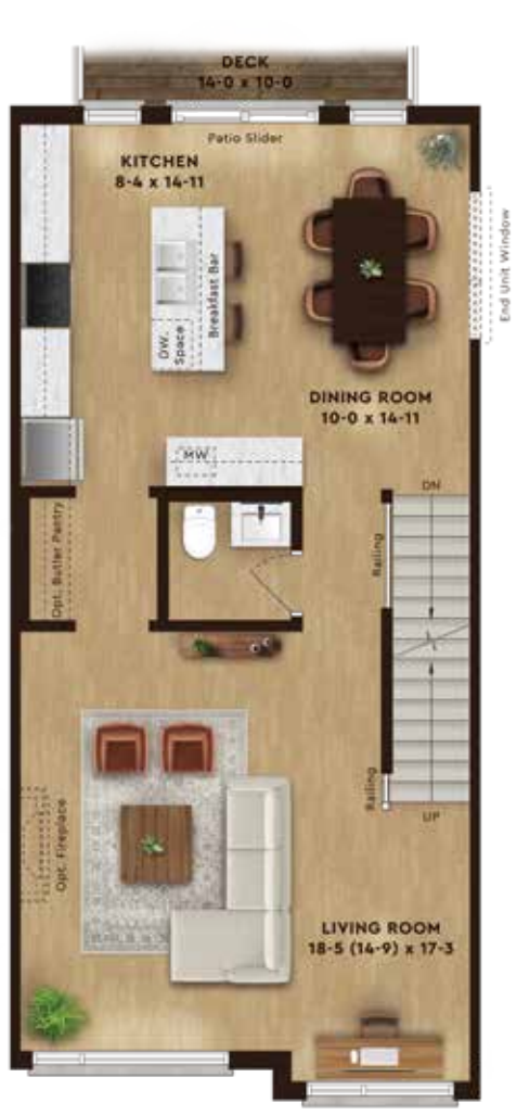
Second Level LIVING & DINING