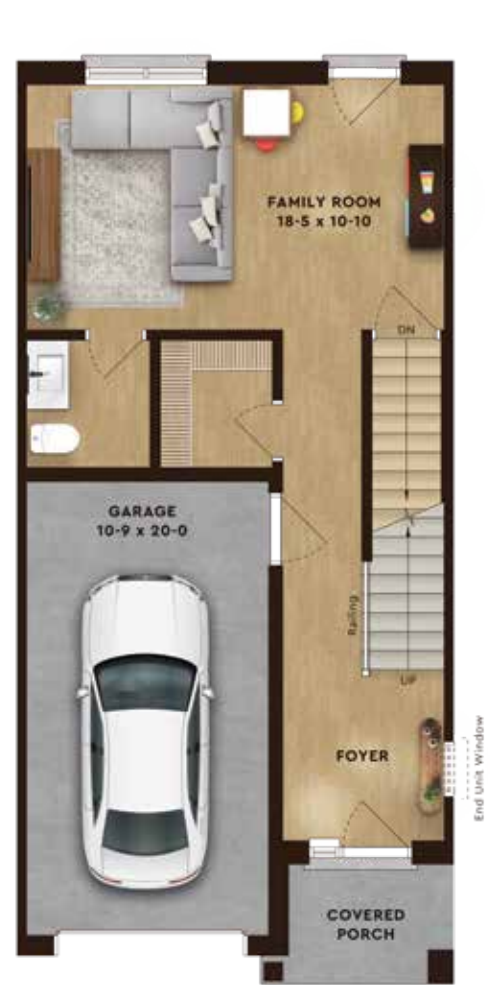
Entry Level FAMILY ROOM