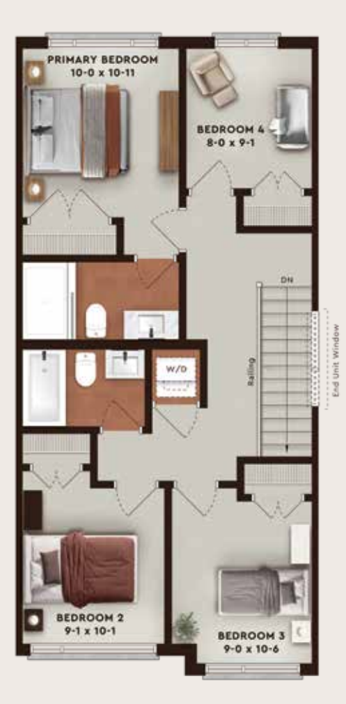
Third Level – Optional 4 BEDROOMS